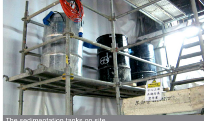
The sedimentation tanks on site

And the minimization of noise generation is our second concern. Some noisy works have been scheduled during MTR's non-operation hours to avoid the noise nuisance towards merchants, passengers, nearby residents and pedestrians. We believe our persistent effort on environmental protection has upheld our performance excellence on the overall project quality."