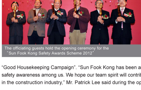
The officiating guests hold the opening ceremony for the "Sun Fook Kong Safety Awards Scheme 2012"