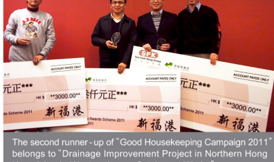
The second runner-up of "Good Housekeeping Campaign 2011" belongs to "Drainage Improvement Project in Northern Hong Kong Island - Western Lower Catchment Works"