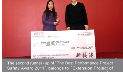
The second runner-up of "The Best Performance Project Safety Award 2011" belongs to "Extension Project of Footbridge Network along Tai Ho Road in Tsuen Wan"