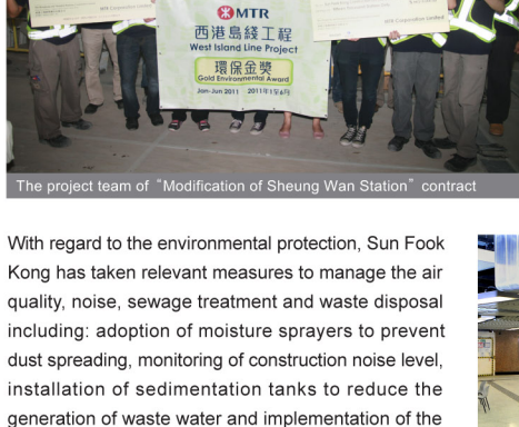
The project team of "Modification of Sheung Wan Station" contract

In recognition of its outstanding performance in environmental protection and safety management for the West Island Line Project, Sun Fook Kong has been granted "Gold Environmental Award", "Silver Safety Award" and "Lowest Reportable Accident Frequency Rate Award" by the MTR Corporation Limited. The "West Island Line Contract No. 701 – Modification of Sheung Wan Station" commenced in April, 2010. To transform the Sheung Wan Station from a terminus to an intermediate station, the scope of work includes installation of new rail tracks and overhead power lines, new passenger lifts, enlargement of the East Concourse and improvement works to the station facilities.