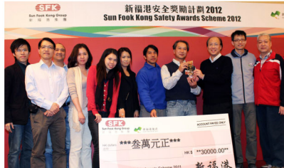
The championship of "The Best Performance Project Safety Award 2011" belongs to "MTR West Island Line Project - Modification of Sheung Wan Station"

"Sun Fook Kong Safety Awards Scheme 2012" has already been launched to promote Sun Fook Kong's emphasis on quality, efficiency and safety, and to strive for continual work safety.