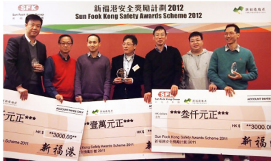
The championship of "Good Housekeeping Campaign 2011" belongs to "Drainage Maintenance and Construction Project in Mainland South Districts 2007-2011"