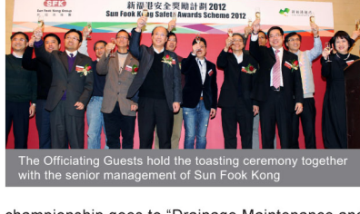
The Officiating Guests hold the toasting ceremony together with the senior management of Sun Fook Kong

It was announced in the ceremony that "MTR West Island Line Project - Modification of Sheung Wan Station" won the championship of "The Best Performance Project Safety Award" of "Sun Fook Kong Safety Awards Scheme 2011"; "Drainage Improvement Project in Northern Hong Kong Island - Western Lower Catchment Works" won the first runner-up; and "Extension Project of Footbridge Network along Tai Ho Road in Tsuen Wan" won the second runner-up.